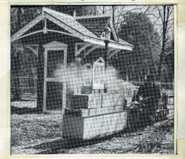
A REAL STEAM-POWERED WORK TRAIN HAULING CONSTRUCTION MATERIALS TO "END-OF-TRACK"!

are held at rotating locations each month, and work sessions are usually held at the tracksite the following day. Previous experience as a railroad nut has never been required...just hang around and you will become one soon enough!