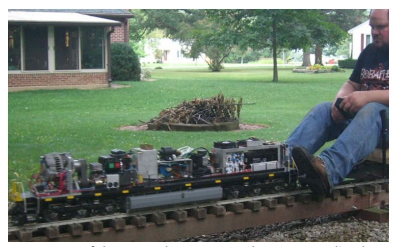
Test run of the new Balmer Loco Works SD70ACe diesel.

Below: Virginian doing her first successful test run on the rolling table. Both photos: Chuck Balmer, Aug 23 2014