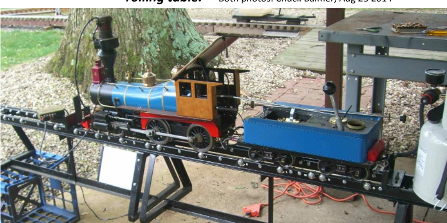
Mud Ring Monthly ~ September 2014 ~ Page 7

Below: Virginian doing her first successful test run on the rolling table. Both photos: Chuck Balmer, Aug 23 2014