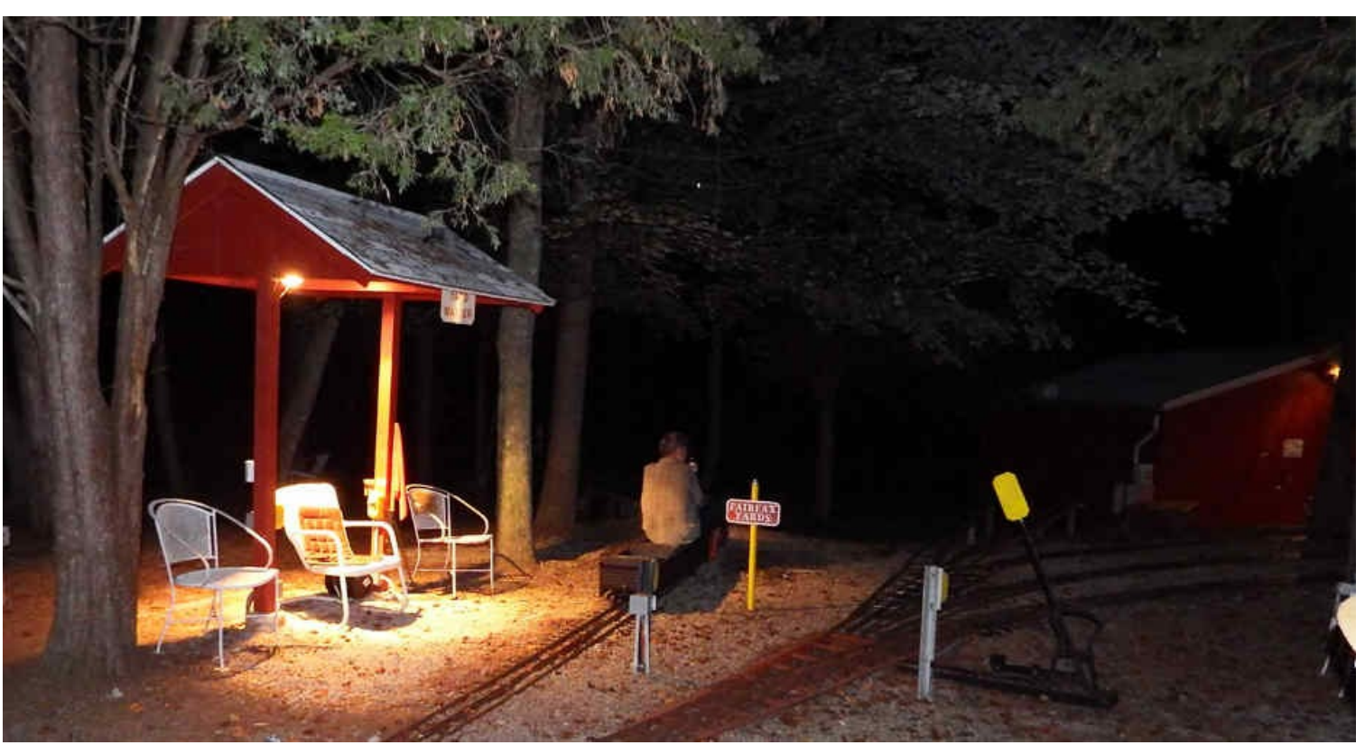
Quiet Night Scene at the Track