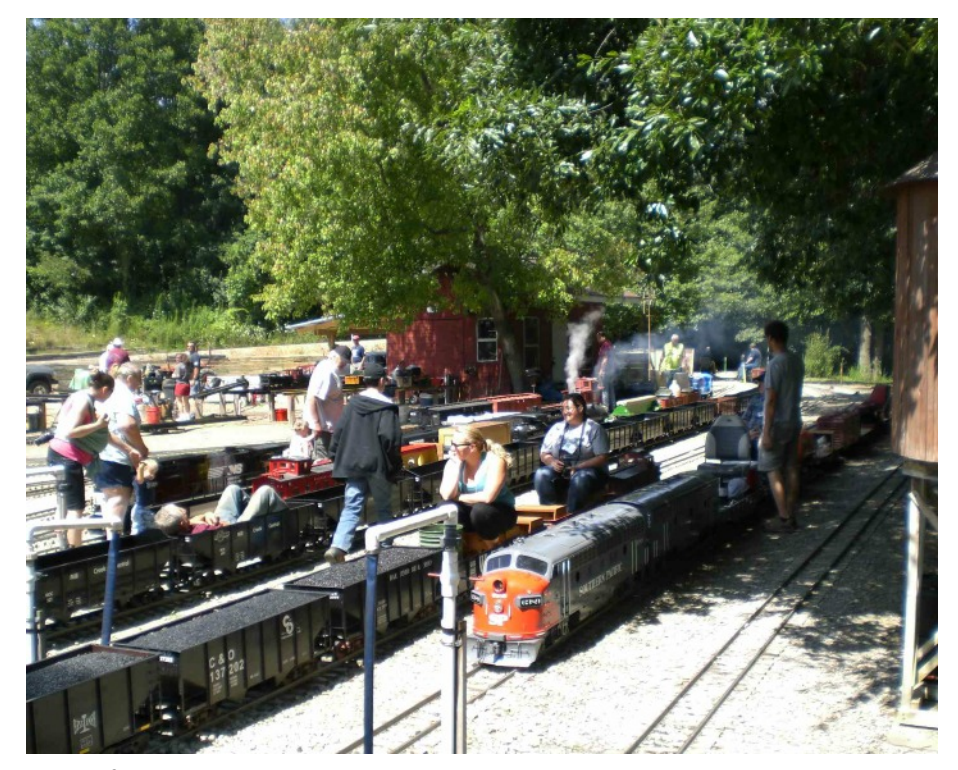
The five photos on this and the proceeding page were taken at the Mill Creek Central RR during the Buckeye Convention.