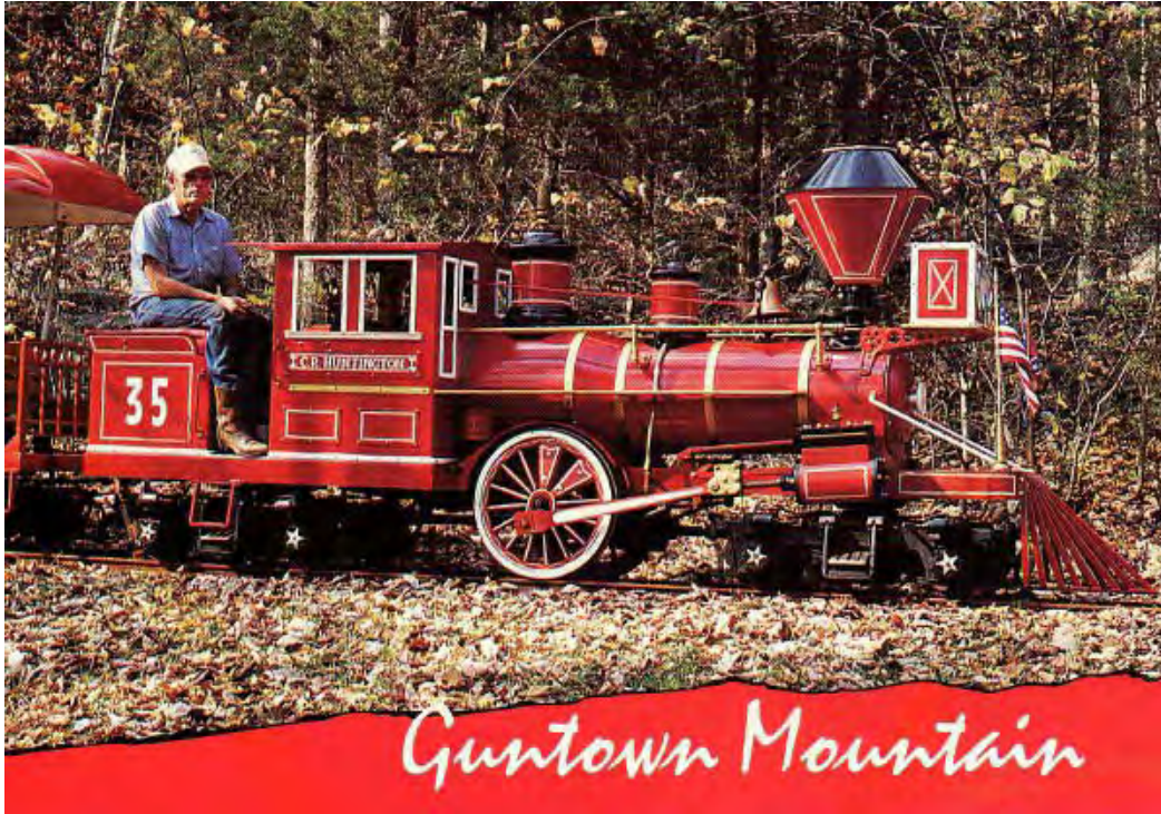
A spit and polish #35 operating near Mammoth Cave. She's for sale.