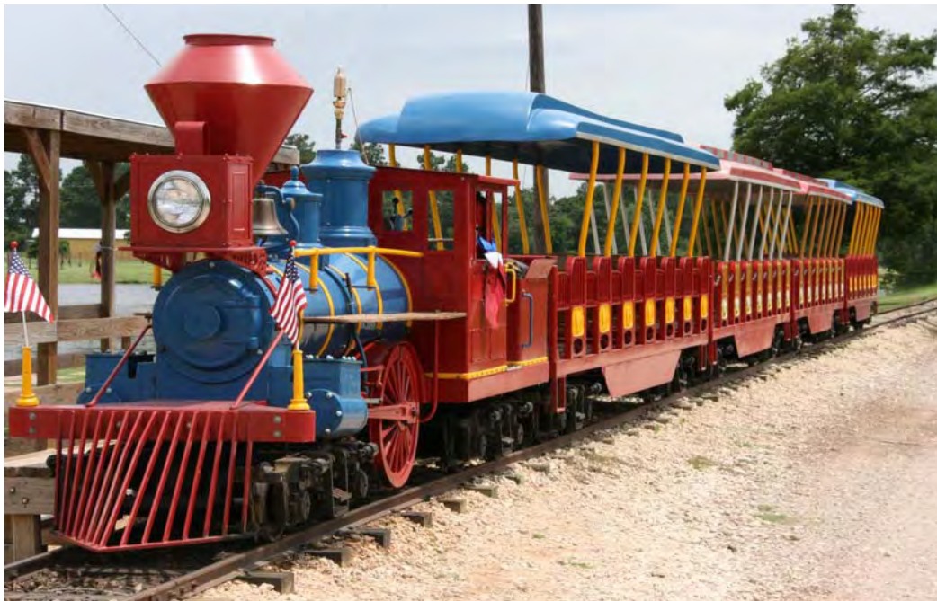
#34 as she looks repainted today near Houston, Texas