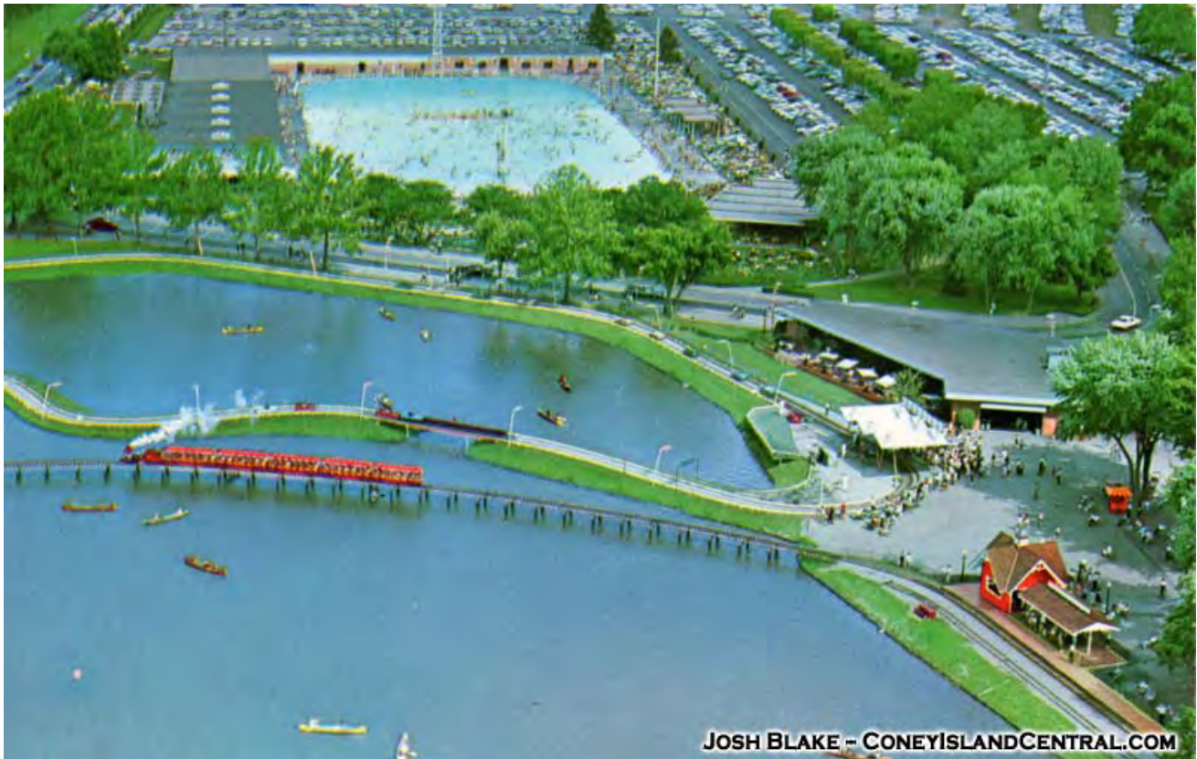
CI&LC #34 crossing Lake Como. Note the red gas pump in front of the station.

She had been given a new all red factory paint job, indicating that it had made a trip back to Wichita for a thorough going over. Due to rising insurance costs, in October 2005 all of the rides at Guntown Mountain were sold by Norton Auctions. As of this writing, the train and 2.5 miles of track is in storage at Beech Bend Park in Bowling Green, KY. The owner of the park tells me it is for sale. Anyone interested?