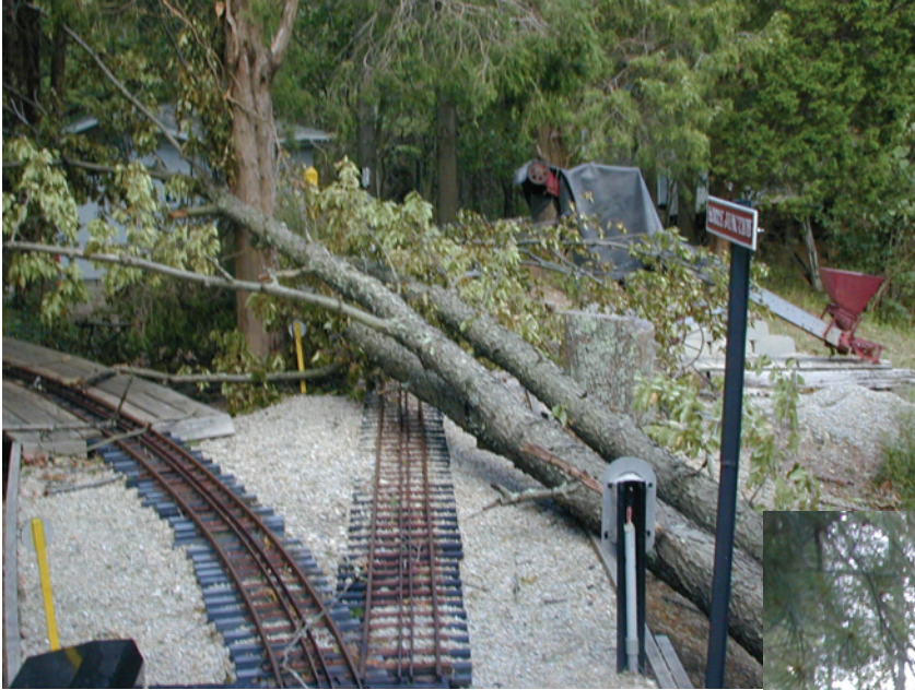
Damage to the track from the remnants of Hurricane Ike.